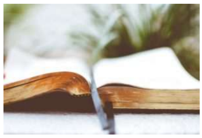
4

Wonderful Counselor – Some translations have a comma between these two words, which indicate two separate thoughts. Yet several others do not, which would imply one thought. When the two words are connected together, one is truly amazed at the advice or counsel which we can receive from our Lord.