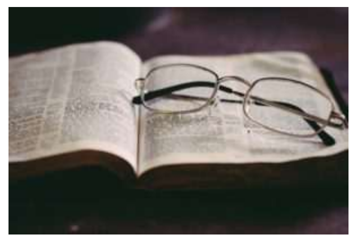
6

There are also three great works of the Holy Spirit revealed to us through an ancient prophecy. In Acts 2:17-21, the prophet Joel is quoted by the Apostle Peter and it is there that Peter attributes three great works to the Holy Spirit: Revelation (17-18), Confirmation (19-20), and Salvation (21, see 22-41).