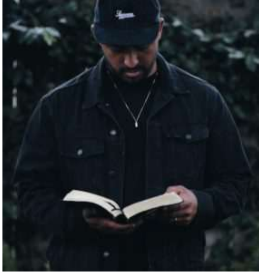
5

What would we say when either by divine revelation or just being aware of circumstances, we knew our time on earth was soon over?